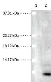
Lane 1: MW Markers Lane 2: Human cell lysates (15 µg)

WB of Ubiquitin Monoclonal Antibody (Clone 5B9-B3) at a dilution of 1:1,000.