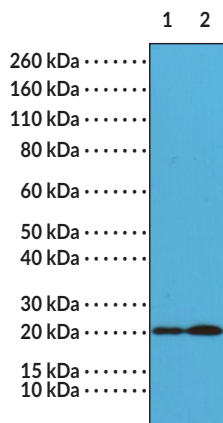
Lane 1: HeLa cell lysates Lane 2: MCF-7 cell lysates

WB of HeLa cell and MCF-7 cell lysates using Smac (C-Term) Rabbit Monoclonal Antibody (Clone RM271) at a dilution of 1:1,000.